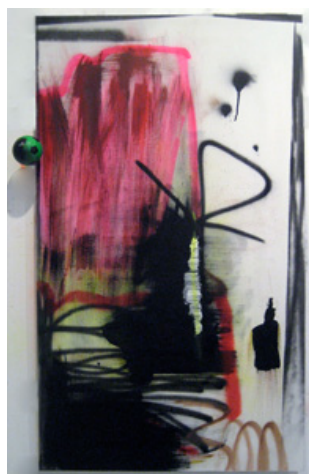
Wendy White, "Block from Smack," (2007). Acrylic and spray paint on canvas, metal, foam. 63 x 36 in.

Like a homemade blade to the golden throat of the status quo, the eight paintings in Freeze Frame are convincing and sharp. For the most part, the eight women who make up this show have chosen not to stray too far from a plainclothes abstraction that can range from the personal and passionate to the hell-for-leather. In other words, there's enough quality stuff here to light a fire in every train yard oil drum from Maine to the Mobile Bay—they mean what they're doing and it shows. As a group-show thankfully lacking some contemptible curatorial theme, it allows for enough pushback among the paintings to keep things interesting, difficult, and open. It's a reminder that art can happen on a local level, where people argue and have something to say, as opposed to some faceless, nameless, global mass of intellectual morality.